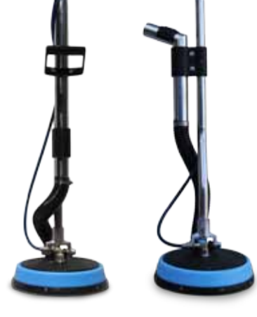
Model No. 8901 & 8902

Update your cleaning arsenal and order the new Spinner today!