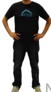
NPR With PAUL New Product Review